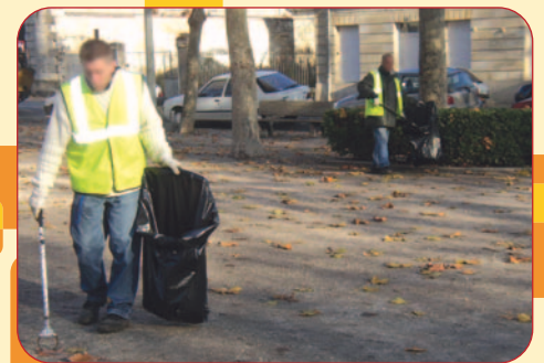
50% of the funding for the homeless integration programme was provided by the European Union

A very flexible system has been put in place to meet the expectations of the beneficiaries: the possibility of working a few hours a week, a weekly wage to encourage motivation, and social assistance backed by the partner structures. To this end, two integration companies, Aquitaine Interim Insertion and Insert’net, take on and supervise the employees. The participants are guided and assisted in the integration process by social workers (from accommodation centres). Results for the first year (2003-2004):