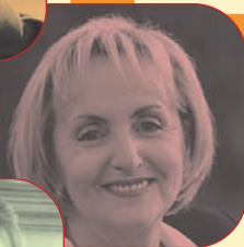
Conchita Lacuey, Member of Parliament and Mayor of Floirac