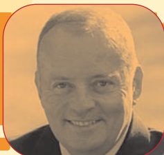
Hugues Martin, Member of Parliament and Mayor of Bordeaux

With the backing of Europe, we can take the risk of launching into new initiatives which, if conclusive, may serve as references and be used elsewhere. The Urban2 programme is a pilot project and we are happy to experience all its social dimension, with and for our inhabitants. These projects, alongside those that each of us is also conducting in our respective municipalities, strengthen the social cohesion of our territory and contribute to the harmonious development of a city showing greater solidarity.